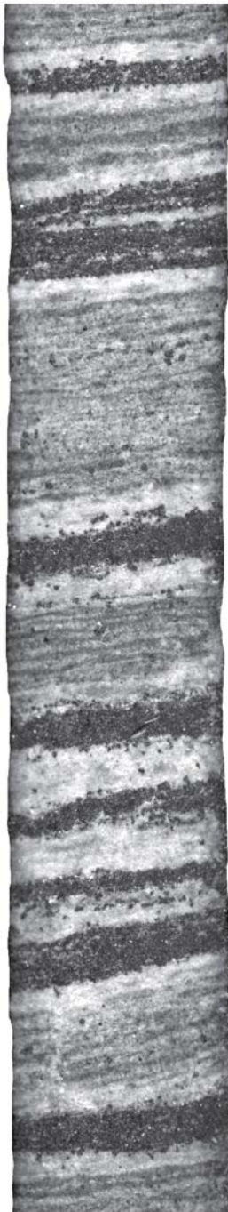
Figure 4: BIF drill core from the Kuruman Iron Formation, South Africa. Dark layers are composed of magnetite, light layers are siderite, and grey layers are composed of chert and hematite.